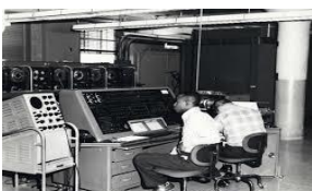
UNIVERSAL AUTOMATIC COMPUTER