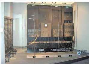
ENIAC (A Digital computer)